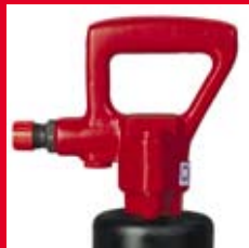
CP 0222 CHOT handle