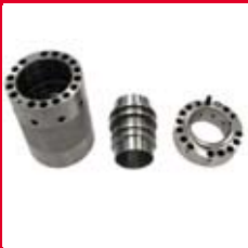
Special Boyer valve