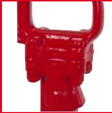
CP 0111 rugged 4 bolt backhead locking mechanism

They are particularly popular with rental outlets because of their rugged and straightforward design and their versatility of use.