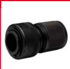
Quick change retainer