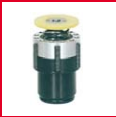
New Vibration Reduction Assembly