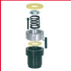
Stronger components and lower vibration levels