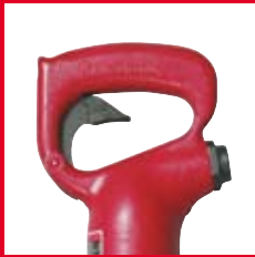
CP 0012 handle based on the famous CP 0009 design