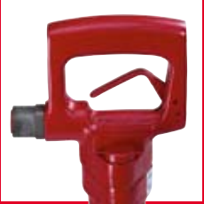
CP 0222 CHIT handle