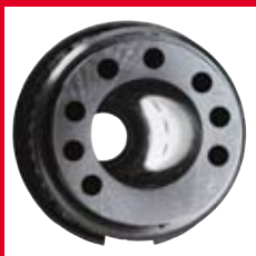
CP 4125 special heat treated cylinders with chrome plated bores for extra durability