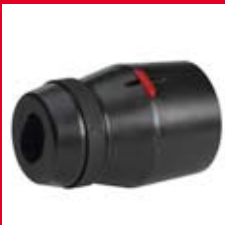
Quick change retainer

Chicago Pneumatic accessories are available to make your hammer even more effective. Make steel replacement even quicker by using one of our quick change retainers. Extend the life of your hammer by removing moisture and