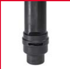
Spring type retainer