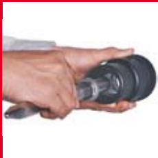
CP17 SVR and FL22 SVR "quick-change" retainer