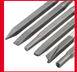
Special Jumbo Shank steel accessories for rivet busters

Users have discovered many new applications for rivet busters for working in both concrete and steel. No longer is the buster used exclusively by iron workers for forming and cutting rivets, but it has now found its way into the hands of operators who need the most powerful tool for the job.