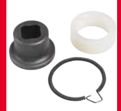
Lower sleeve, Polyurethane bumper and standard retainer spring