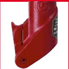
CP 0222 retainer latch