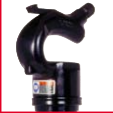
Pistol grip handle