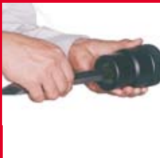
CP17 SVR and FL22 SVR "quick-change" retainer