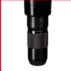
Screw cap retainer