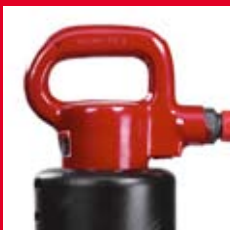
FL 0022/FL 0025 handle