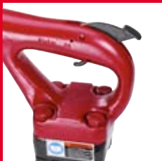
CP 4130 four bolt flange for increased durability, strength and ease of service